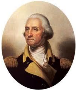
General George Washington